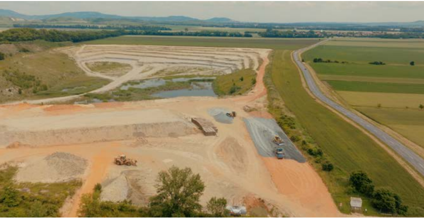
Clay pit of the production plant