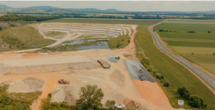
Clay pit of the production plant