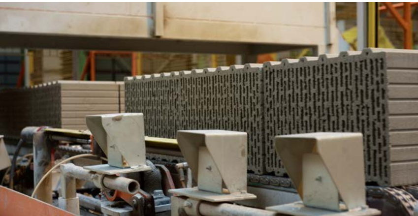
Dried semi-finished product