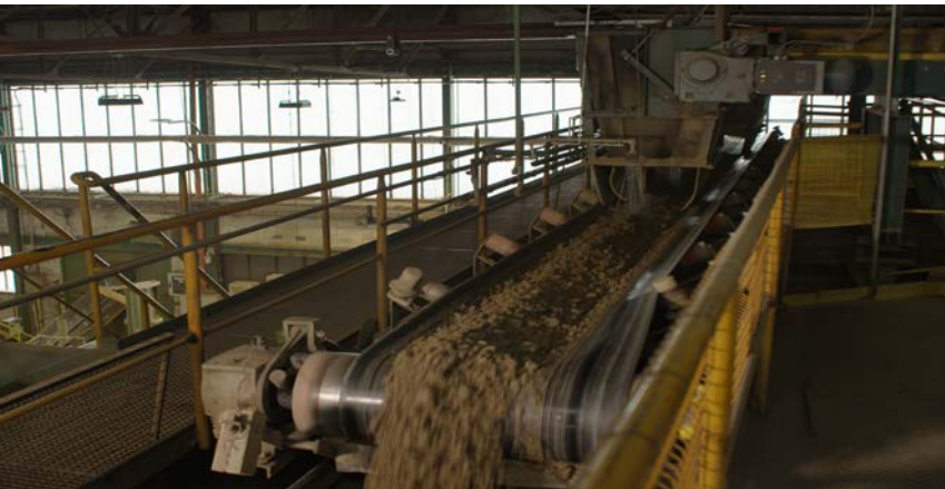
Preparation of raw material