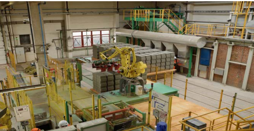
View of the production line